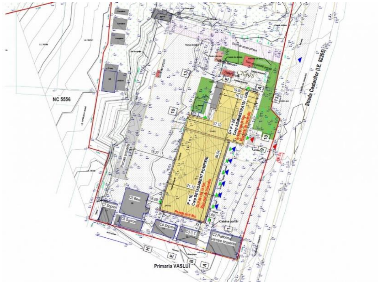
Fig. 3 Designer drawing – Land and Buildings of CESI and close neighbors.

The area is bounded by public and private property land plots with 4 floor apartment blocks and unifamilial houses. Within a radius of 100 meters from the future construction site there are 8 single-family houses, 2 apartment blocks of 3 and 4 floors, 2 small universal shops, several small buildings housing economic activities as well as Ion Mincu High School.