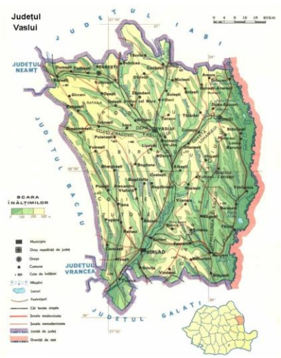
Fig. 7 The map of Vaslui County

According to the 2021 census the population of Vaslui is 63 035 inhabitants, 13.7% higher than in the previous census in 2011, when 55 407 inhabitants were registered. Last data available shows that the majority are Romanians (98.62%), with a minority of Roma (1.19%). From a confessional point of view, the majority of inhabitants are Orthodox (88.58%), 2.12 are of other religion, and for 9.29% the religion is unknown.