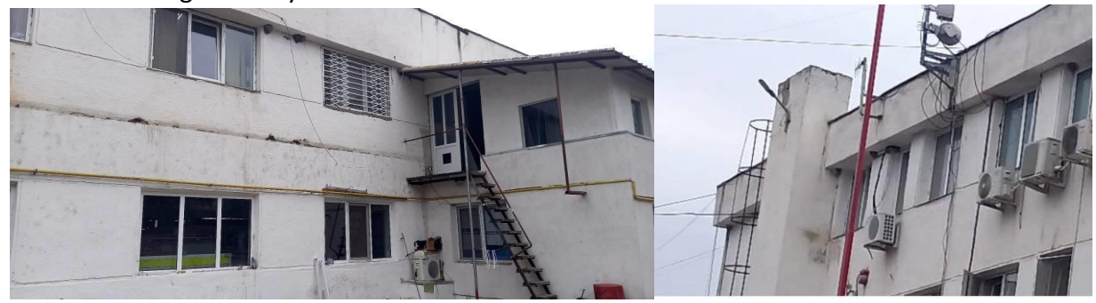
Fig.5 The existing building lack of maintenance and is visibly damaged

The construction system of the building is represented by continuous reinforced concrete beams and load-bearing masonry walls confined with reinforced concrete elements.