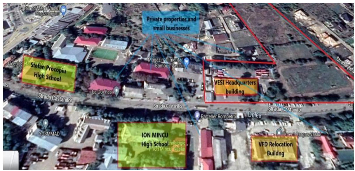
Fig.4 Neighboring area of Vaslui Emergency Situation Inspectorate

The existing building is not part of the list of historical monuments and is not located in the protection area of a historical monument.