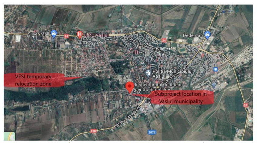
Fig.2 Positioning of Vaslui ESI Headquarters currently and after relocation

The emergency situation activity in Vaslui county consists in providing firefighting and SMURD ambulance services to an area of 5318 square km, serving approximately 395 500 persons in 449 settlements organized under 86 territorial administrative units including three municipality and two towns.