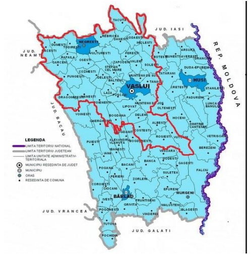
Fig. 1 Vaslui Firefighting Detachment intervention area

Vaslui County Emergency Situation Inspectorate "Podul Înalt" (VESI) provides permanent and unitary coordination - at the level of the county's local committees and operational centers for emergency situations - of voluntary and private services for emergencies and also of the prevention, monitoring and management of emergency situations. The emergency situation services in Vaslui county are ensured by three firefighting subunits located in different settlements across the county (Vaslui, Huşi and Bârlad), with the largest headquartered in the same building as the county inspectorate.