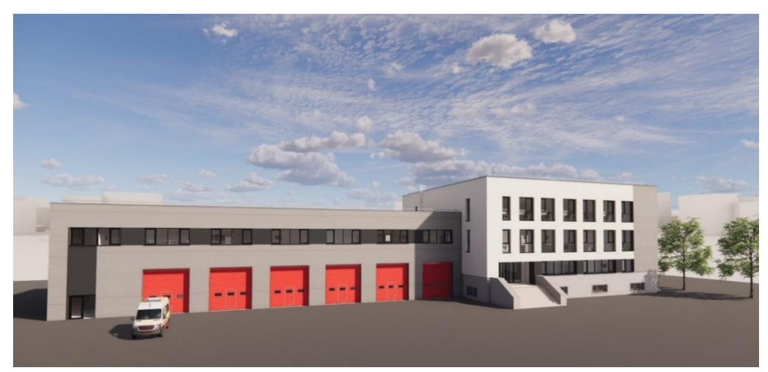
Fig. 6 The proposed new building design

The proposed new investment is made up of a two sections building, one for the Fire-Fighting Detachment with a garage at the ground floor and administrative area at the 1<sup>st</sup> floor and one that will serve as headquarters for the County Emergency Situation Inspectorate, with Basement+GF+2F height regime, a footprint of 1,315.4 sqm and a developed area of 3,623.3 sqm.